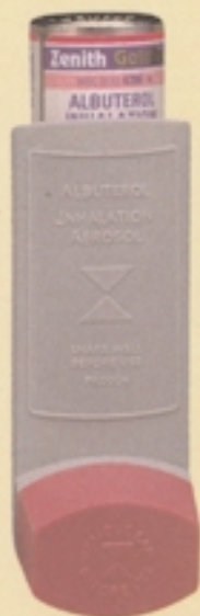
Zenith Goldline ® albuterol