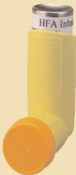
Proventil HFA ® albuterol