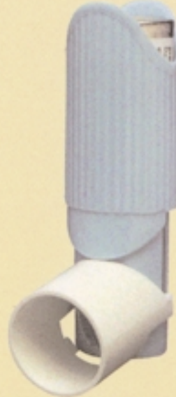
Maxair Inhaler ® pirbuterol