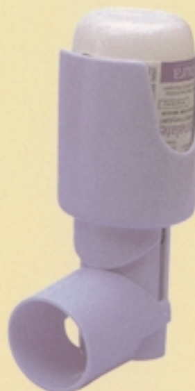
Tornalate ® bitolterol mesylate