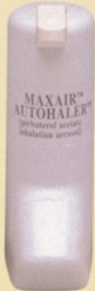
Maxair Autohaler ® pirbuterol