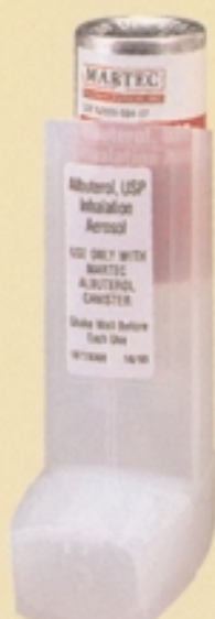
Martec ® albuterol