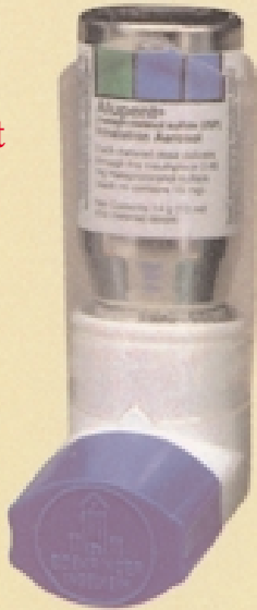
Alupent ® metaproterenol sul- fate