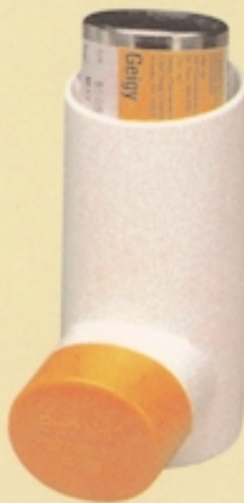
Brethaire ® terbutaline