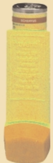
Proventil ® albuterol