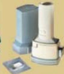
Foradil® Aerolizer™ formoterol fumarate inhalation powder