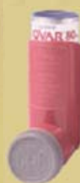
QVAR® beclomethasone dipropionate HFA