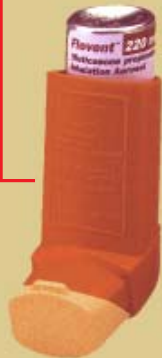
Flovent® fluticasone propionate