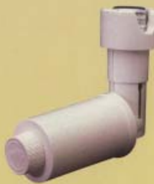
Azmacort® triamcinolone acetonide