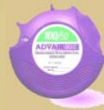
Advair Diskus® fluticasone propionate/ salmeterol inhalation powder