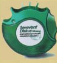
Serevent Diskus® salmeterol xinafoate inhalation powder